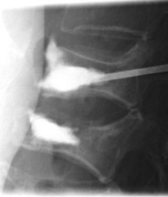
Bone cement placement shown in X-ray.