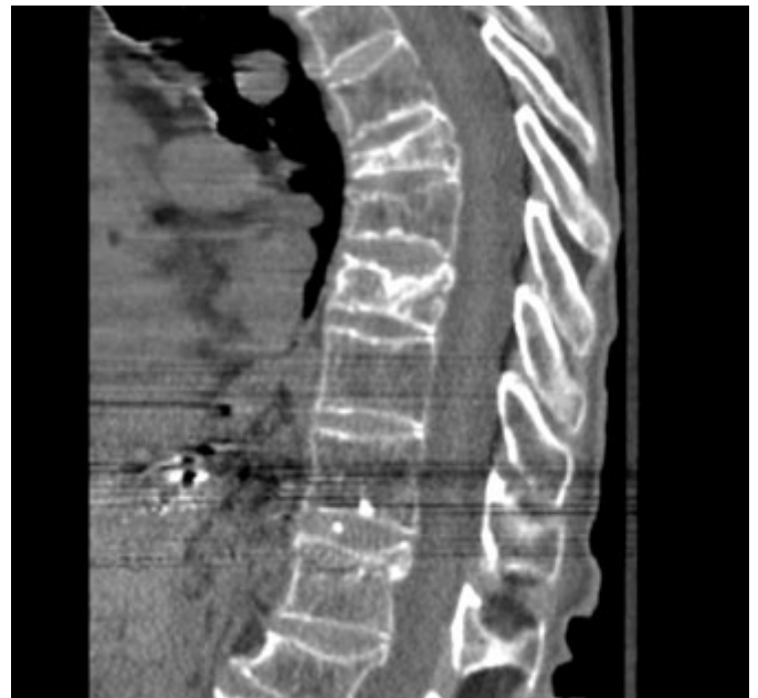
Multiple vertebral fractures seen in a CT saggital reconstruction.

Patient selection is the critical factor in achieving treatment success. Incidental compression fracture is common in elderly patients with back pain due to other problems, such as disk disease and spinal stenosis. The